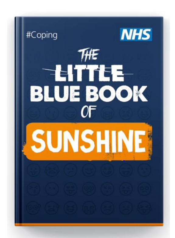
The Little Blue Book of Sunshine

NHS Berkshire West and East Berkshire Clinical Commissioning Groups (CCGs) have relaunched the mental health booklet – the Little Blue Book of Sunshine.