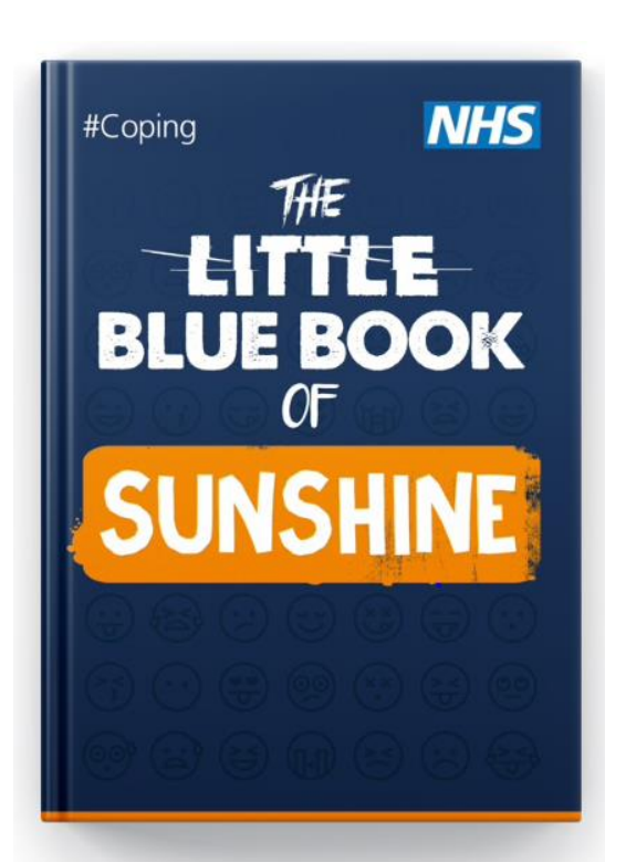
The Little Blue Book of Sunshine